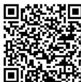
Donate to art installation