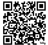
Scan to register for movie

By joining us, you become an integral part of a dynamic community of faith-driven individuals dedicated to preaching, teaching, and actively working towards healing the climate in 2024. Govans film screening will take place on Thursday, April 25 at 6:30 p.m. in Sharp Hall, followed by a panel discussion of the film. We hope you will join us. Please register using the QR code.