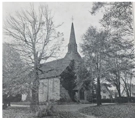
Govans in 1904

The story of income inequality in this country has foundations in the accumulation of property as a way of