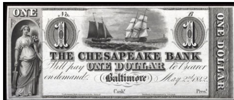
1842 Bank Note