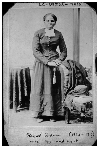
Harriet Tubman (ca. 1820-1913)