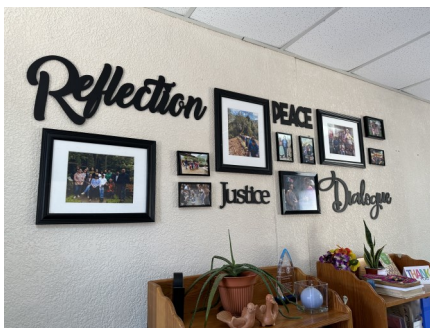
CEDEPCA office in Guatemala City

During the month of April we will be focusing on The Protestant Center for Pastoral Studies in Central America or CEDEPCA as our mission for the month. CEDEPCA started 35 years ago in Guatemala. The country was torn with the violence and conflict as a result of civil war (1960-1996). Racism and classism played a significant part in this violence. The Indigenous people were frequently victims in this chaos. Of the 200,000 people who died or "disappeared" during this period, 80% were indigenous people.