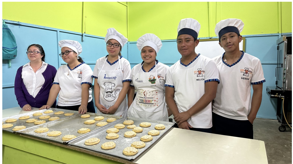
Participants in the bakery program in Guatemala City funded through the PC(USA)’s Self Development of People initiative and OGHS.

Truly, One Great Hour of Sharing has had a significant impact for the individuals and their families in Guatemala. Please consider a generous gift in our April, Lenten appeal.