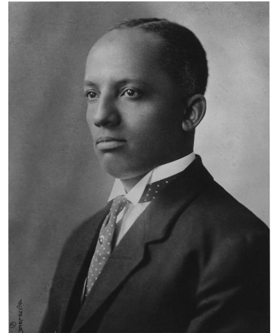
Carter G. Woodson was a scholar whose dedication to celebrating the historic contributions of Black people led to the establishment of Black History Month, marked every February since 1976. Woodson fervently believed that Black people should be proud of their heritage and all Americans should understand the largely overlooked achievements of Black Americans.