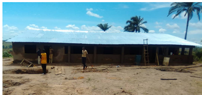
Maternity Clinic in Tshimbundu

If you would like to help, your donations can be sent to Friends of Butoke, 32942 Kiwi Court West, Lewes, DE 19958 or give online at www.friendsofbutoke.org .