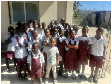
Children at the elementary school