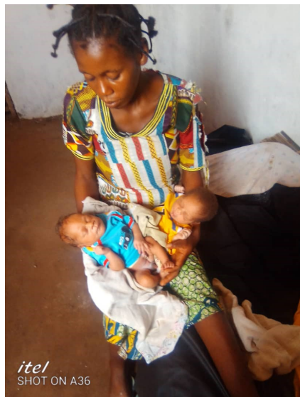
Mother with identical twins