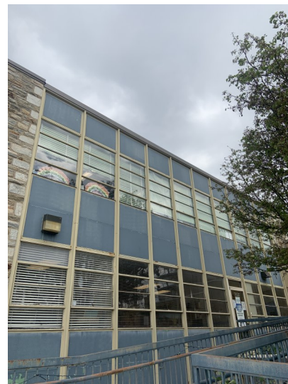
South facing window wall

We also approved our tenor section leader Dave Willerup who is a skilled furniture maker to build two roll top desks for the AV equipment in the back of the sanctuary. Dave specializes in environmentally conscious building with reclaimed lumber. His work includes a recently completed AV booth for Light Street Presbyterian.