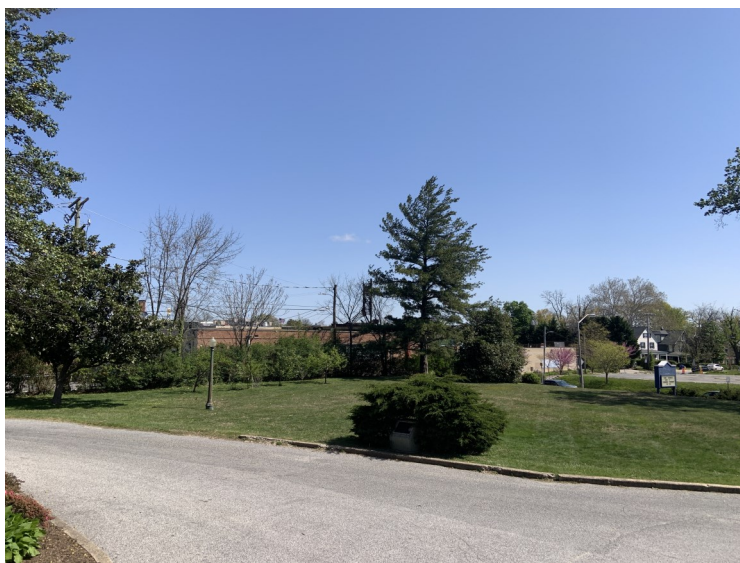
North east corner of the front lawn - site of potential community garden

Please speak with Pastor Tom, Pastor Billy, or any member of the Session if you have any questions or feedback.