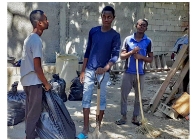
Boys at Unity House cleaning yard

"We are happy to see them working together with a good spirit for the progress of the house where they live."