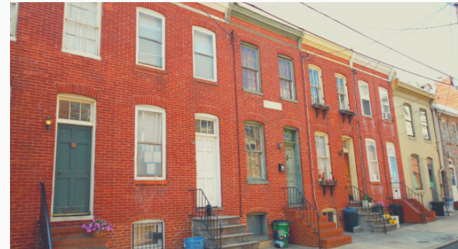
Frederick Douglass Houses

This New York Times Review, "A Landmark Reckoning With America's Racial Past and Present" calls the book that began with the New York Times' Pulitzer Prize-winning 1619 Project by Nikole Hannah-Jones "a wide-ranging, landmark summary of the Black experience in America." Click here to read the review.