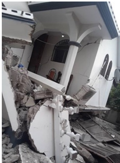
Damaged medical intern residence in Les Cayes

The underlying theme in each of the ten letters received is trust in God's love despite unending hardship. "...Give light to my eyes, or I will sleep the sleep of death, and my enemy will say, "I have prevailed"; my foes will rejoice because I am shaken. But I trusted in your steadfast love; my heart shall rejoice in your salvation. I will sing to the Lord, because he has dealt bountifully with me."