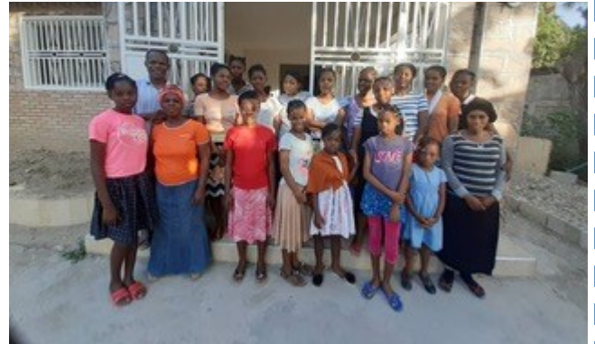
Girls at front entrance to Kay Papa Nou