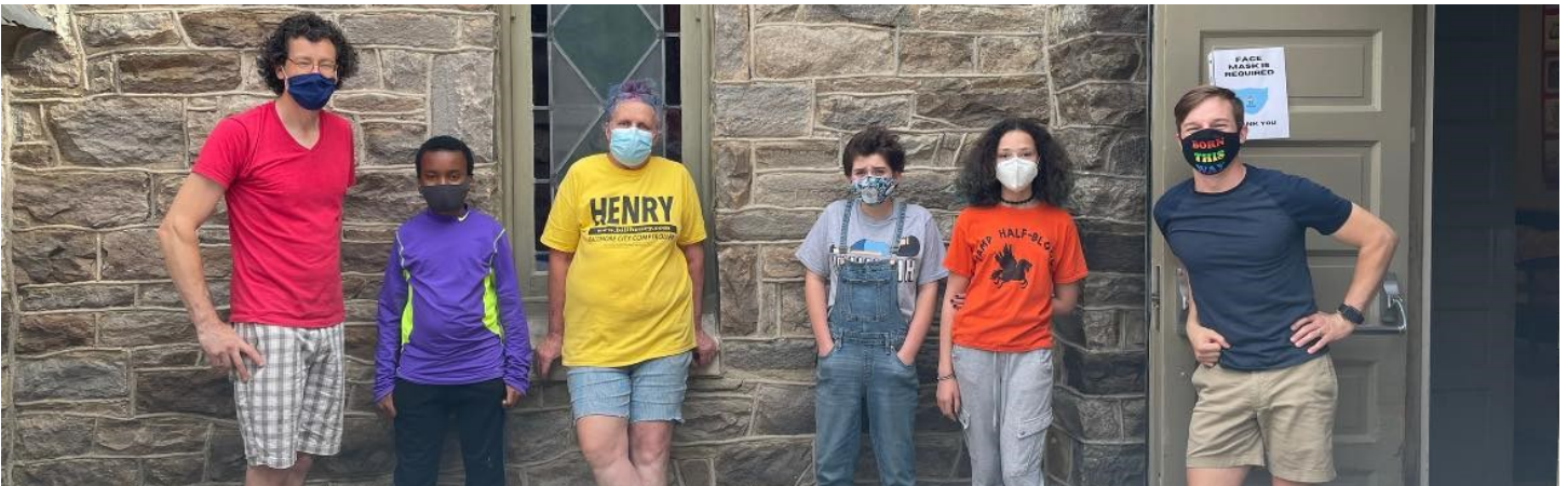
Volunteering at Soul Kitchen is a great way to give back to our community.