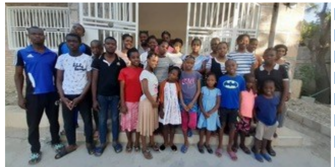
Girls of Kay Papa Nou with a few of the boys from Unity House