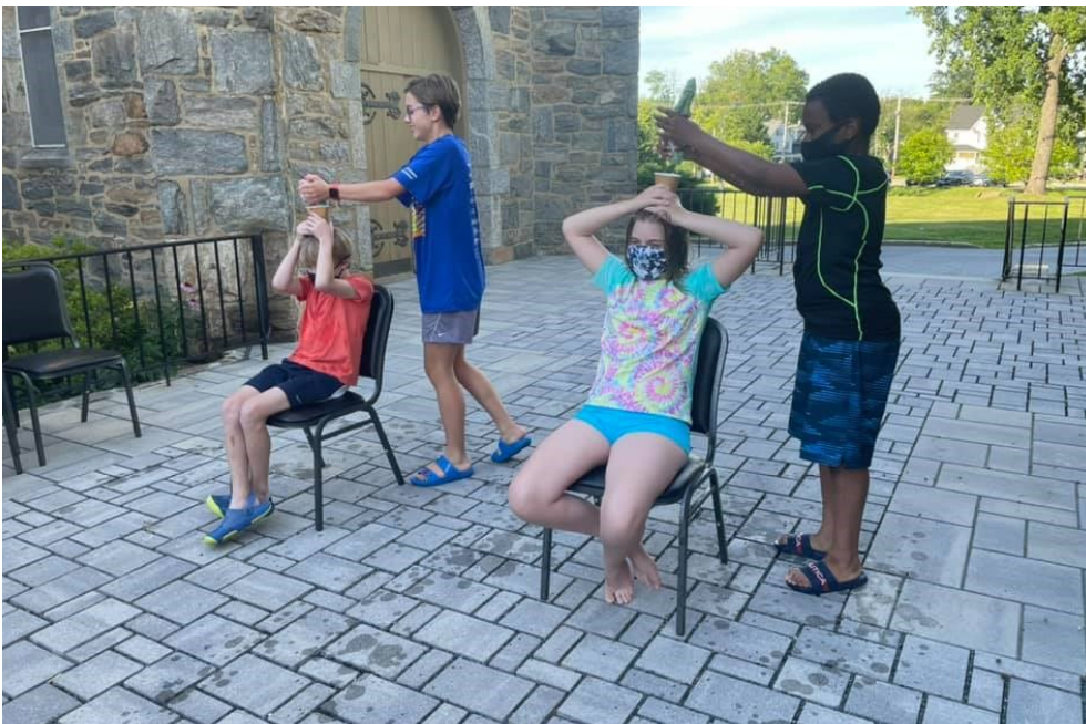
Govans Youth Group beats the heat on Water Play Night on the Peace Terrace on June 25.